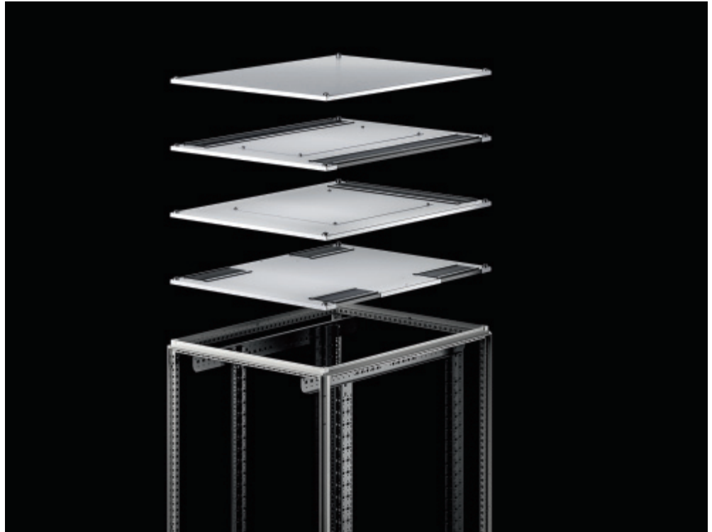
Figure 3: Freedom of choice, also for the protection class-compliant roof concept