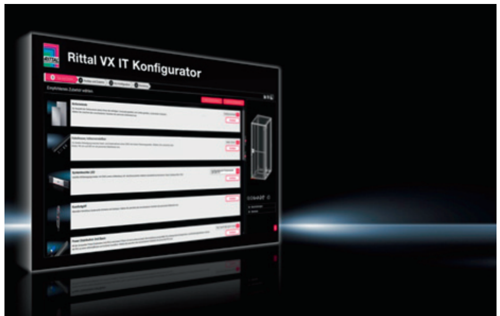
Figure 6: Every VX IT you create using the Rittal Configuration System (RiCS) is fully certified. Testing covers accessories, as well.

time will vary, depending on the degree of customisation of the rack. The accessories can be delivered separately and enclosed loose with the order, or they can be provided already mounted.