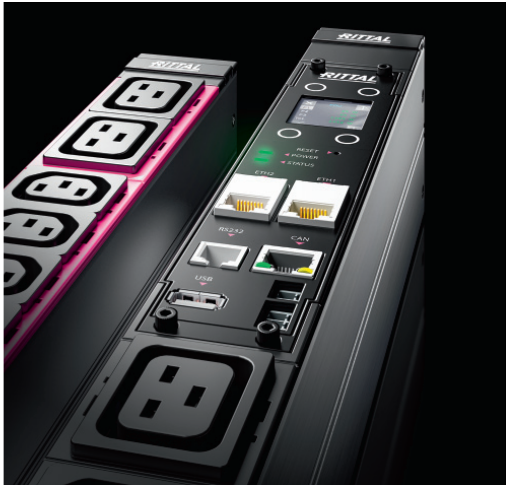
Figure 4: Slim fit: The compact and slim design of Rittal PDUs is unique on the market. This allows Rittal PDUs to be mounted in the space between the side panel and the 19-inch mounting frame.

below the 19-inch level and the side panel of an IT rack is referred to as the zero-U-space. With the VX IT, it is possible to install a Rittal PDU there.