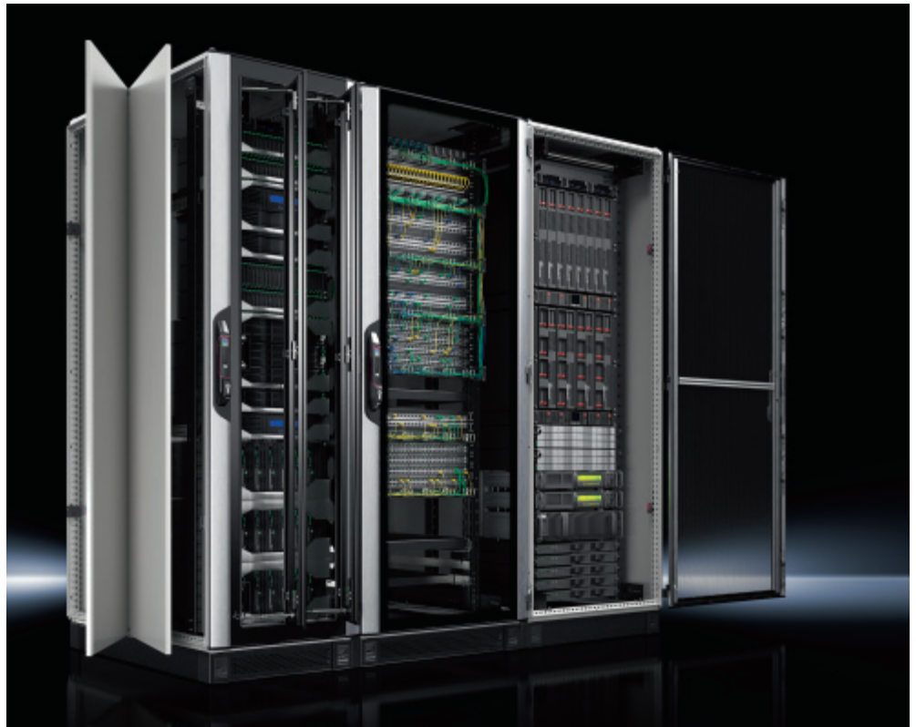
Figure 5: The wide variety of accessories makes the VX IT a platform for all application scenarios, from network enclosures to solutions for hyperscale data centres.

areas of monitoring, power supply and asset management so that the IT rack can be ideally adapted to individual requirement. The Rittal Configuration System guide the purchaser step-by-step and systematically through the selection process.