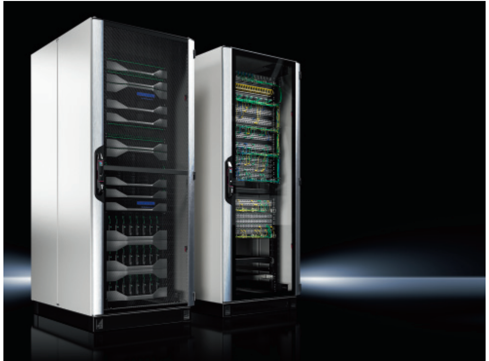
Figure 1: The brand new IT enclosure VX IT is a universally applicable rack solution in modular format for even more freedom in the rapid construction of data centres.